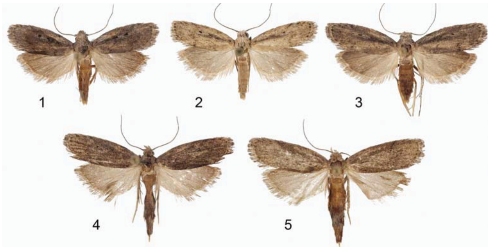
Figs 1–5. Habitus of Aphomia murciella (Zerny, 1914), Tabernas. 1–3 – males (18, 17 and 19 mm); 4–5 – females (20 and 22 mm).

Differential diagnosis. The costal area of A. murciella is generally pale compared to other European Aphomia species. The female genitalia of A. murciella are somewhat similar to those of Aphomia unicolor (Staudinger, 1879), but they differ in having both apophyses very long; the ratio of posterior apophyse length to eighth abdominal segment width is 6.2, whilst it is only 1.8 in A. unicolor . The worn specimens of A. murciella could be mixed with Corcyra cephalonica (Stainton, 1866) because of very similar structure of the male genitalia