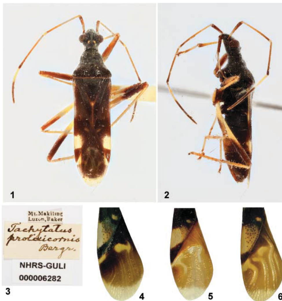
Figs 1–6. 1–3 – Tachytatus prolixicornis Bergroth, 1918, lectotype, female. 1 – dorsal view, 2 – lateral view, 3 – labels. 4–6 – Membrane of Tachytatus species: 4 – T. celebensis sp. nov., 5 – T. prolixicornis Bergroth, 1918, 6 – T. redeii sp. nov.

strong, anterior lobe of pronotum with weak and scattered punctures. Scutellum triangular, longer than wide, only slightly protuberant, without Y-shaped elevation. Clavus with four rows of punctures, second row not always reaching base, often with an incomplete fifth row distally. Endocorium with two divergent rows of punctures, another row near apical margin; mesocorium irregularly punctate. Costal margin of corium slightly concave, apical margin hardly convex. Membrane with four veins, not forming cells. Prosternum with decumbent short hairs. Metathoracic scent gland ostiole provided with auriculate peritreme strongly