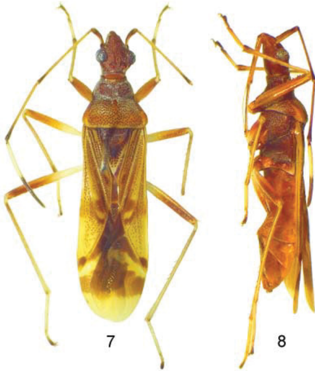
Figs 7–8. Tachytatus longirostris sp. nov., holotype, female (7 – dorsal view, 8 – lateral view).

curved posteriorly, situated close to coxae. Evaporatorium relatively small, occupying only medial half of metapleuron. Legs slender and very long, anterior femur very slightly thickened, more slender than vertex, on inner surface with a few short spines and some long hairs, other femora and tibiae straight, unarmed. First tarsal segment much longer than other two segments together.