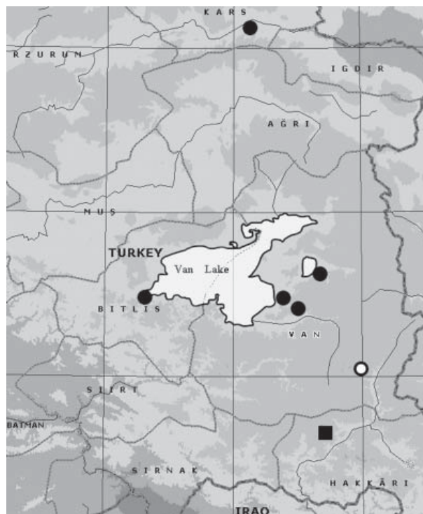
Fig. 9. Distribution of the genus Zophohelops and the subgenus Helopocerodes ( Nalassus ) in south-eastern Anatolia. Black circle – N. faldermanni (Faldermann, 1837); white circle – N. kaszabi Nabozhenko, 2001; square – Z. montanaticus sp. nov.