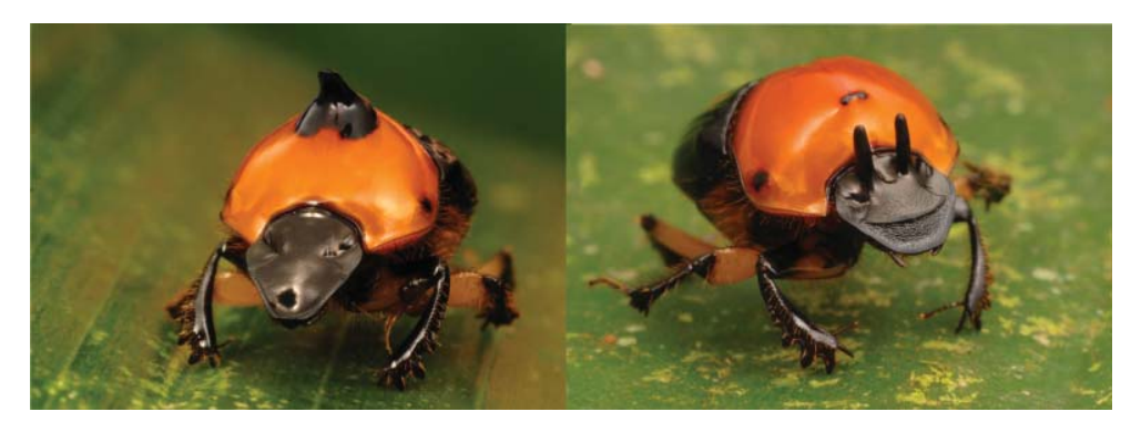
Figs. 16–17. Field photos. Onthophagus rutriceps sp. nov., male left (16), female right (17).