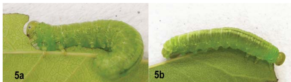
Fig. 5. Pristiphora bohémica sp. nov., larva: a – lateroventral view; b – dorsolateral view. Scale: 5 mm.

slightly shorter than three following tarsomeres combined; inner tibial spur of metatibia a little shorter than half of the metabasitarsus, claws with small inner tooth.