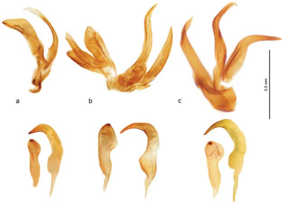
Fig. 4: Parameres (bottom row) and vesical spiculae (top row): a – Acetropis carinata (Herrich-Schaeffer, 1841), b – A. stysi sp. nov., c – A. longirostris Puton, 1875.