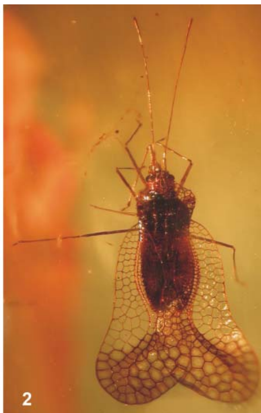
Figs. 1-2. Phymacysta stysi sp. nov. 1 – reconstruction of holotype; 2 – photography of amber inclusion. Scale bar: 1.0 mm.

Antennae very long (0.67 of body length measured from head apex to hemelytron apex) and very thin, especially segment 3; antennae almost nude, only segment 4 covered with short and scarce hairs. Areolate bucculae closed anteriorly, high and strongly projecting beyond clypeal apex. Rostrum moderately long, extended most probably to hind coxae (the holotype has rostrum turned backwards).