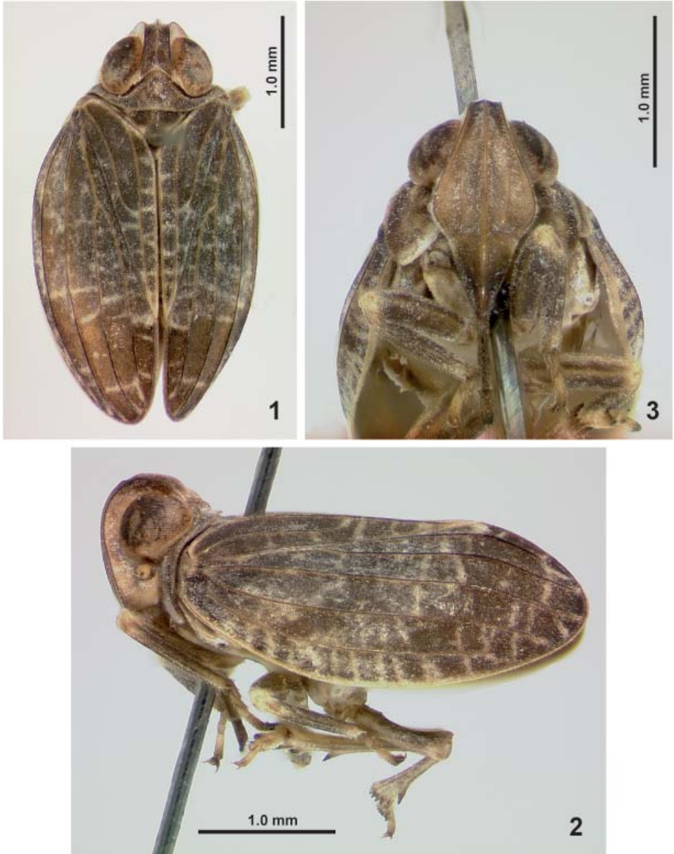
Figs. 1-3. Caepovultus deemingi gen. & sp. nov., holotype, male. 1 – body, dorsal view; 2 – body, lateral view; 3 – head, ventral view.